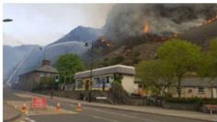
Town evacuated after mountain fire in North Wales